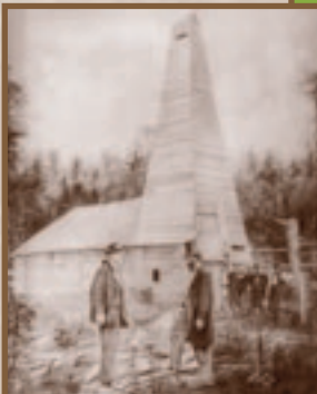
Edwin L. Drake at his oil well in 1861.