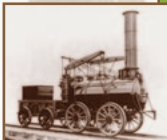
The Stourbridge Lion is the first locomotive ever operated in the U.S. in 1829.