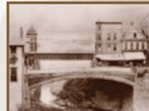
The first metal arch bridge was completed in 1839.