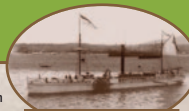
CLERMONT - 1807 First Commercially Successful Steamboat