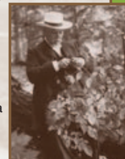
Governor Samuel Pennypacker established game preserves in Pennsylvania in 1905.